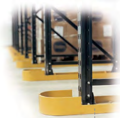
Guide Rails, which also protect the racking, can be fitted to ensure correct truck positioning.